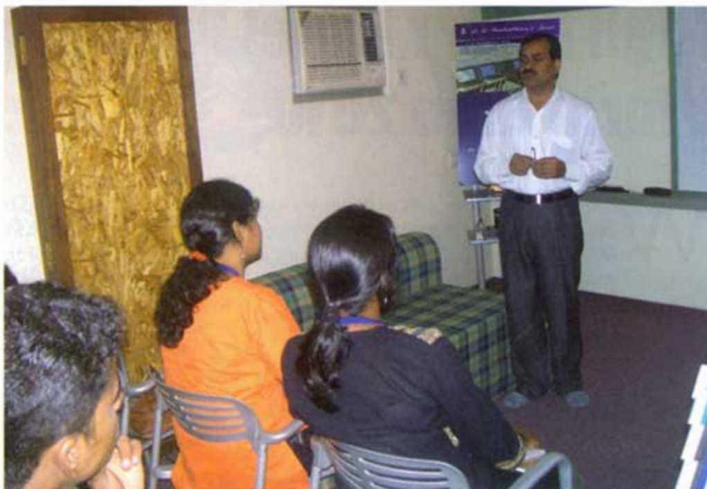
A Training Session in Progress