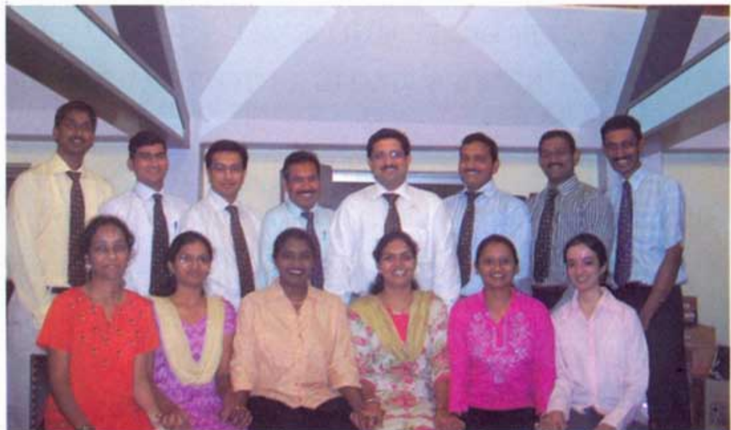
A Beaming Team

~~~~~ With a spurt in terrorist and disruptive acts in different regions of the world, the requirements of safety and the need for sophisticated tools have never been felt as it is now. ~~~~~