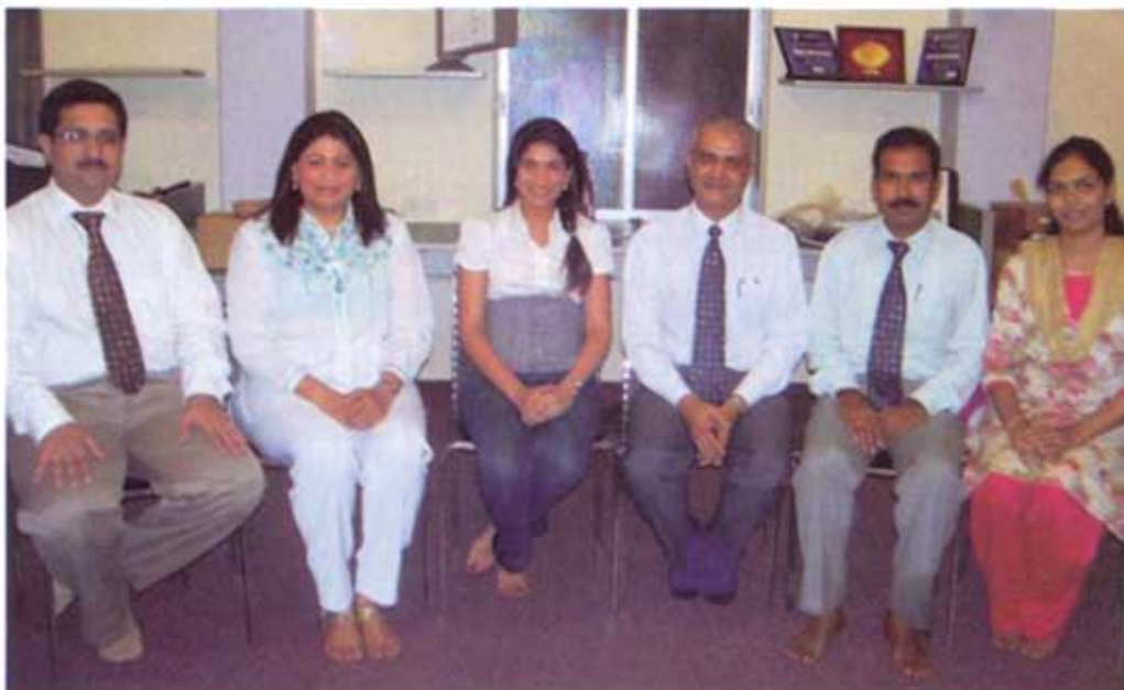
As Moloobhoy & Sons Family

During the late eighties and early nineties, when specialized electronics also became associated with marine safety and became