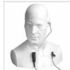
EA15/750 ■ EA15/950 ▲ Covert earpiece / microphone