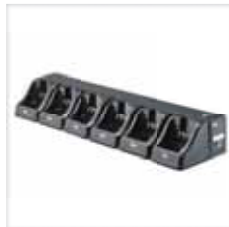
CSBHT ■ Six-way charger

HT649 GMDSS can be supplied in different package combinations, please consult your dealer.