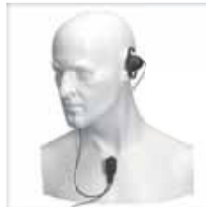
EA12/750 ■ EA12/950 ▲ Earpiece microphone