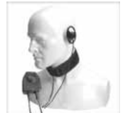
CXR16/750 ■ CXR16/950 ▲ Throat mic. Bone conductive