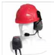
CHP750HS ■ CHP950HS ▲ Hard hat eardefender, submersible PTT

Submersible products are represented with a water droplet.